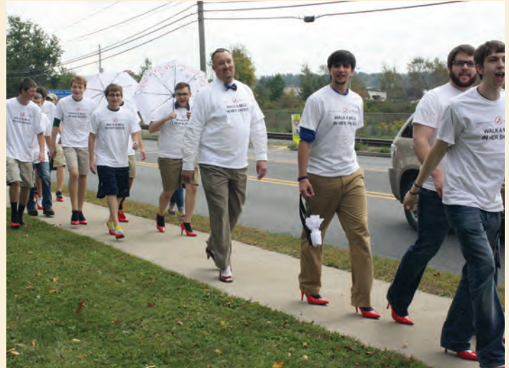
Men in high heels walk along Route 255 in front of campus during the Walk a Mile in Her Shoes event.