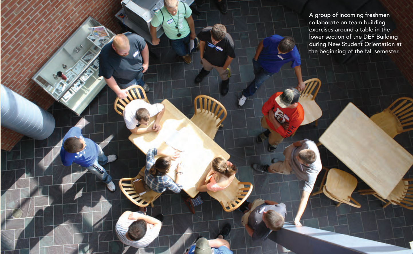
A group of incoming freshmen collaborate on team building exercises around a table in the lower section of the DEF Building during New Student Orientation at the beginning of the fall semester.