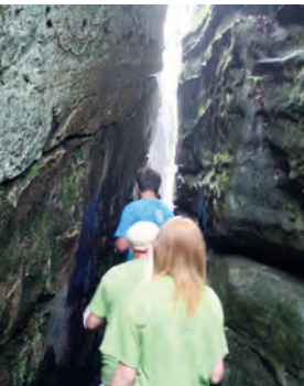
Some of the areas of Bilger's Rocks where the students collected litter on Outreach Day. The area of the public park spans 272 acres.

As part of New Student Orientation, more than 150 freshmen, and over 30 faculty and staff group leaders participated in the Penn State DuBois Community Outreach Day on Friday, August 22. The day began in the campus gymnasium where students were broken into groups and assigned a service site. Each group was led by a campus faculty or staff member, as well as a student orientation leader, who then took students to their work site for the day. In all, the groups visited more than a dozen charitable and community-centered organizations. They performed landscaping, cleaning, litter pick up, and other duties in order to give back to their local communities around DuBois, Clearfield, Falls Creek, and beyond.