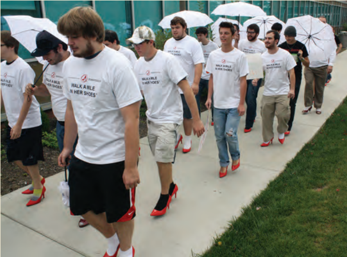
Male marchers moving through campus in high heels.