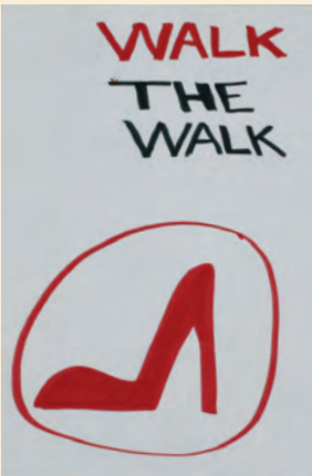
Some marchers made signs to carry with them on the walk.

A total of 34 Penn State DuBois men wore high heels for the Walk a Mile in Her Shoes event on October 1. The men's march is meant to raise awareness of the battle against rape, sexual assault, and gender violence. The event was organized by victim advocacy group, Passages of Clarion, Clearfield and Jefferson Counties, in conjunction with the Penn State DuBois Office of Student Engagement. The idea behind the march is to get men more involved in issues surrounding sex crimes.