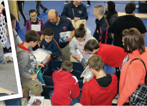
Students had the opportunity to view part of the course their robots will navigate during the BEST Robotics Competition at Penn State DuBois in October.