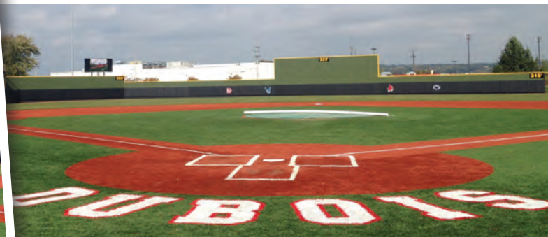
Showers Field, the DuBois community baseball field where home games will be played.